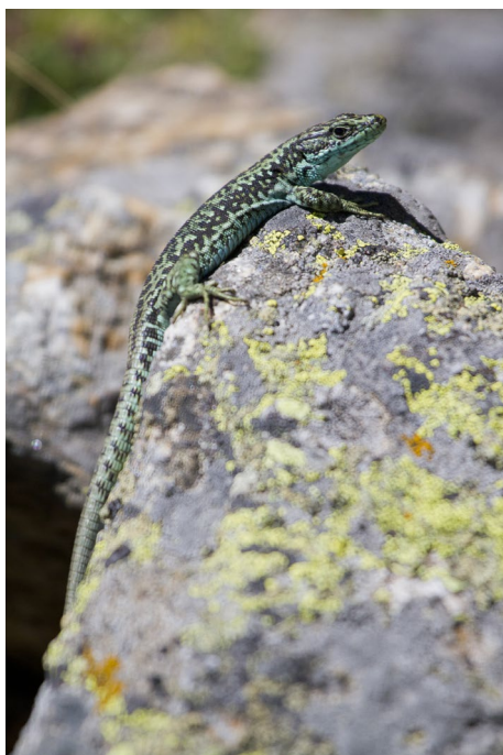
FIGURE 1 Adult male Carpetane rock lizard ( Iberolacerta cyreni ).

The study used 24 adult male lizards (Figure 1) whose behavior had previously been scored (Horváth et al., 2016). They were captured during early June 2013 at the slopes of “Alto del Telégrafo” (Sierra de Guadarrama National Park, Madrid Province, Spain, 1,900 m asl, approximately). Individuals were transported to the “El Ventorrillo” Field Station (1,500 m asl, approximately), 5 km downhill from the capture site, where they were housed individually outdoors in opaque plastic boxes (56.5 cm × 36.5 cm × 31.4 cm; length, width, height, respectively). In the boxes, we used a thin layer of coconut fiber as substrate and provided a hollow brick as shelter. Water and food (House crickets [ Acheta domestica ] and Turkestan cockroaches [ Blatta lateralis ]) were provided ad libitum during captivity. All lizards were released at the original capture site after the experiments.