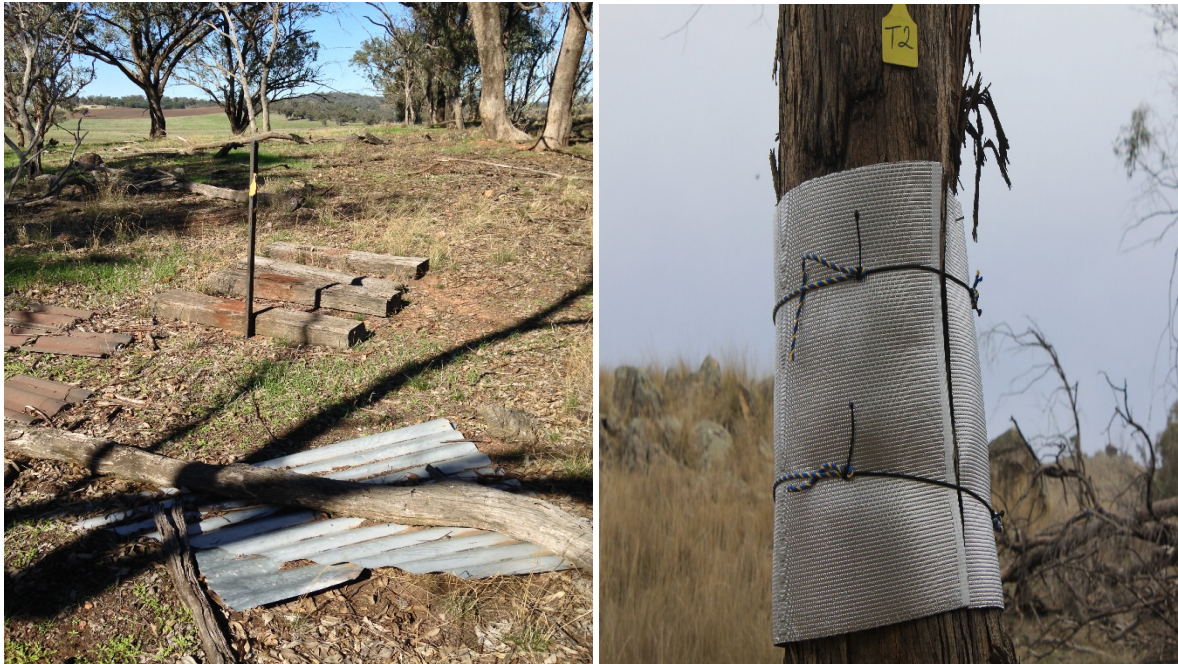
Figure 1. Terrestrial artificial refuges (left), double stack of corrugated steel, roofing tiles and timber railway sleepers. Foil-backed, closed-cell foam (right) used as an arboreal artificial bark refuge.