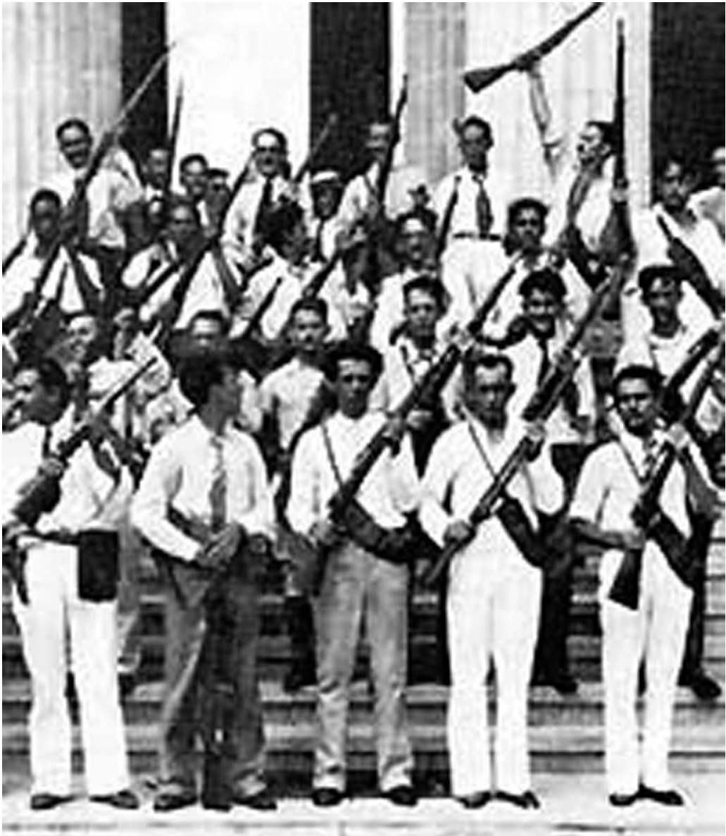
Armed students, Cuba, 1933.

Non-Aboriginal Australians have fought all their wars overseas. Even its first sacred site—Anzac Cove—is in Turkey.