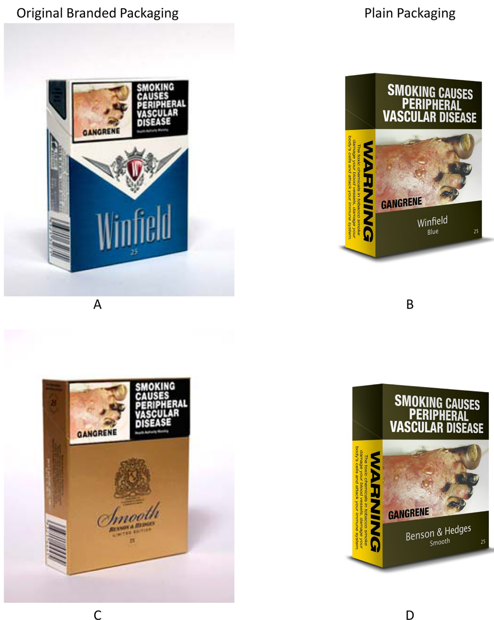
Figure 1 Pack image used for each pack condition within the two by two packaging type (branded vs plain) by brand name (Winfield vs Benson & Hedges) between-subject experimental design.

One notable finding of this research, demonstrating the importance of branding in the tobacco market, was a possible interaction effect between packaging type (branded vs plain) and brand name (Winfield vs B&H). Plain pack images were rated consistently lower than branded images on measures of positive pack, positive smoker and positive taste appeal for the Winfield condition, but no differences were detected for the B&H condition. It might be expected that plain packaging of B&H cigarettes is unlikely to have much effect among socially disadvantaged smokers as this brand is positioned as a premium product at a high price point, 29 with apparent low penetration among this smoker group: only 1.6% of participants reported regularly using B&H cigarettes compared with 9% in the general population. 28 Comparatively, engagement with the