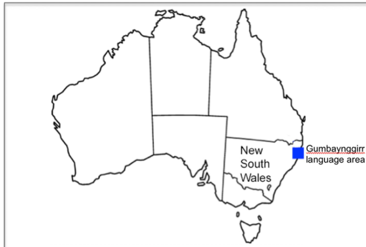
Figure 1. Location of Gumbaynggirr Country

ing for new ideas to continue to engage their students. The project we report on in this paper is one part of a larger, long-term fabric of activity.