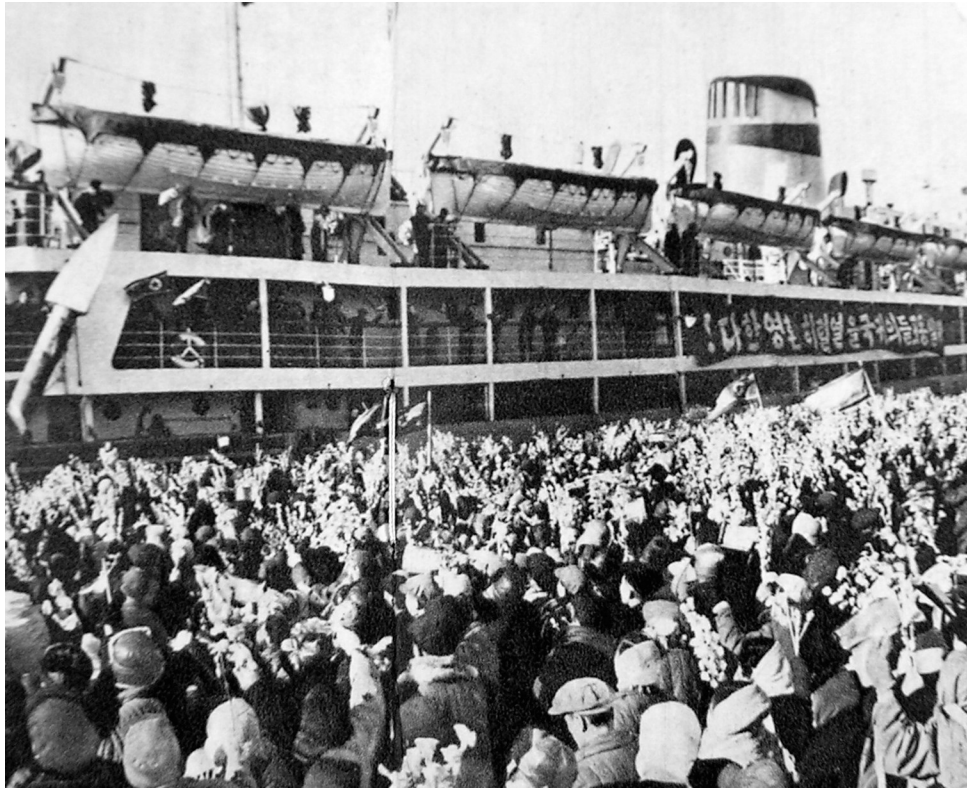
Repatriation Ship Carrying Koreans from Japan arriving in Cheongjin