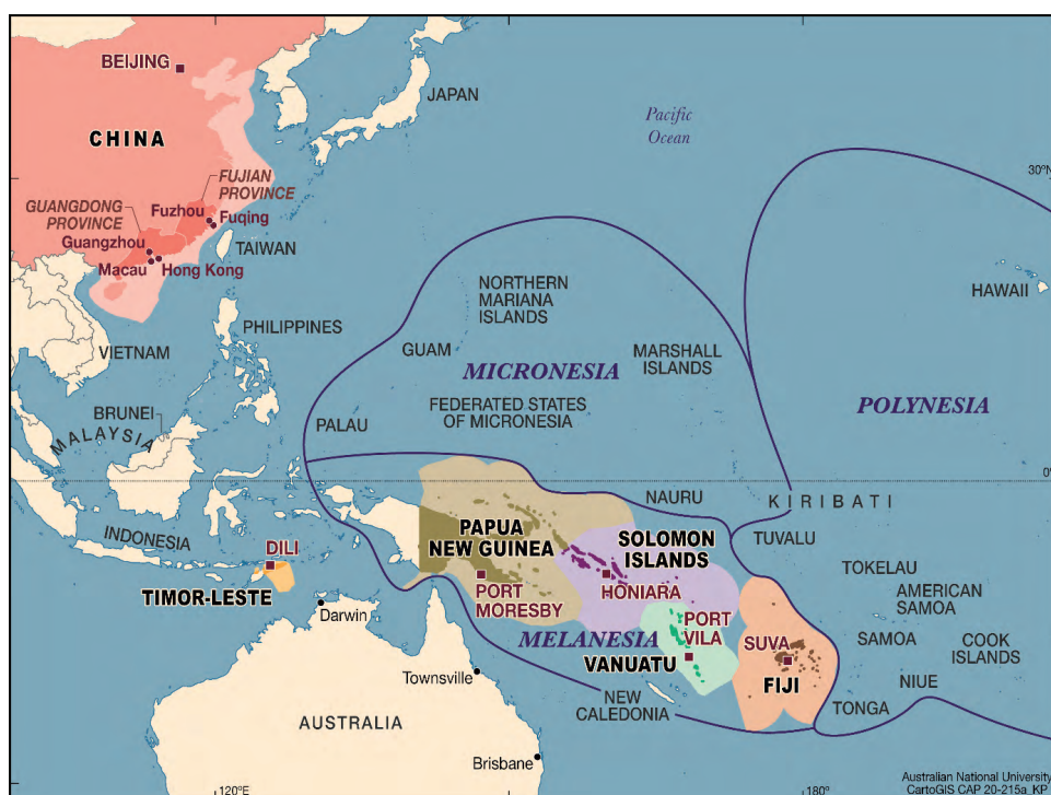
Map 1: States referred to in this article with their Exclusive Economic Zones (EEZs) and the Sub-Regions of the Pacific Islands. 1

Considered ‘peripheral’ in Chinese foreign policy, Melanesia has nevertheless experienced a steady growth in Chinese interests this century, particularly leading up to APEC 2018. This interest brought with it the Belt and Road Initiative – China’s economic quest for global influence, and the public face of China’s grand strategy. Drawing on research from 2017 and 2019, this article examines what changed after PNG joined the BRI in June 2018. It consults a range of well-informed Chinese and PNG perspectives to discern what the BRI means for Melanesia and how Melanesians are responding to it. Is this economic development, geoeconomic influence or both?