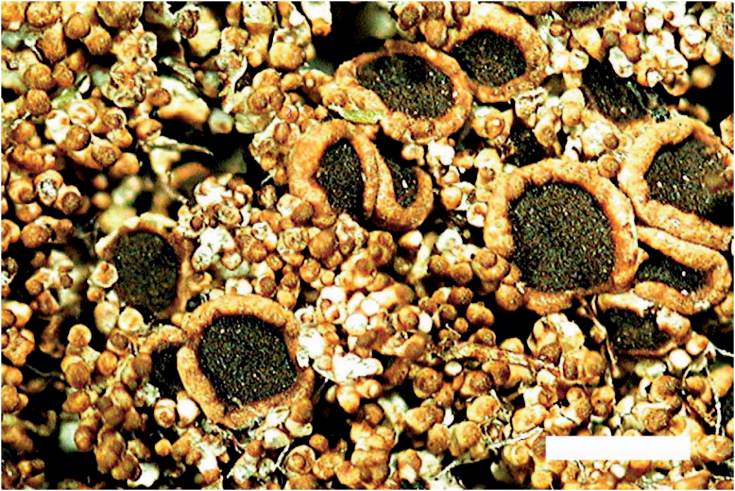
FIG. 1: Rinodina fuscoisidiata , habitus showing the isidiate thallus and the apothecia with plane discs and prominent thalline margins (holotype). Scale = 1mm.

Thallus muscicolous, crustose, densely isidiate, spreading. Isidia simple and globose at first, 0.07–0.2 mm diam., becoming cylindrical, simple or more commonly branched or coralloid, up to 1 mm long, pale chestnut brown to dark brown, darker and often erumpent at the apices, not forming soredia or blastidia (Fig. 1). Cortex paraplectenchymatous, 20–35 \mu\text{m} thick, composed of mesodermatous hyphae with rounded to \pm elongate cells 7–10 \mu\text{m} (textura globularis to angularis), chestnut brown pigmented in the outermost part, colourless in the inner part, totally interspersed with crystals soluble in K. Medulla 60–130 \mu\text{m} , I+ pale blue, totally interspersed with crystals soluble in K. Algal cells chlorococcoid, 8–15 \mu\text{m} diam.