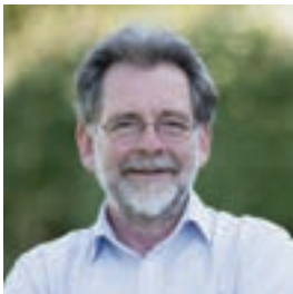
Course Convenor: Professor Hugh White

Asia is in the throes of a major power-political revolution, as a radical change in the distribution of wealth and power overtakes the old order and forces the creation of a new one. Explore three areas of the new power politics of Asia: the nature of power politics as a mode of international relations; the power politics of Asia today, what is happening and where it is going; and concepts that can help us better understand power politics.