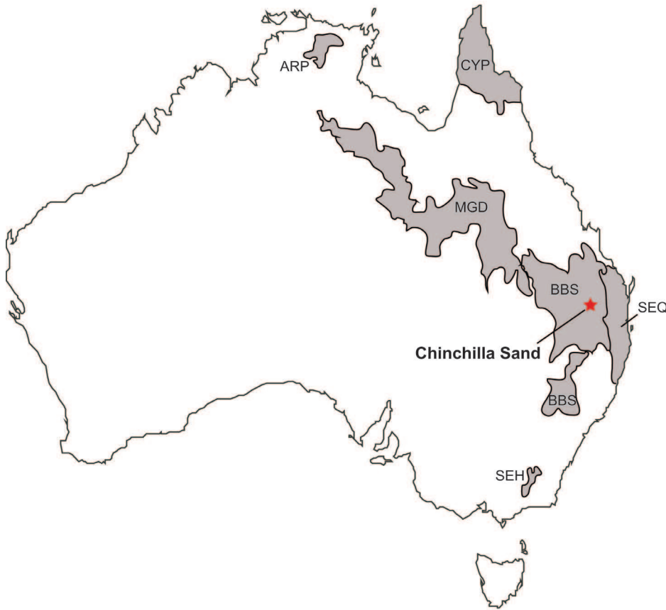
Figure 1. Map of Chinchilla Sand Formation fossil locality. Chinchilla is marked on this map, along with the shaded areas representing the biogeographic zones where modern kangaroo tooth enamel stable isotope values were taken from Murphy et al. 2007a to compare to fossil values. Abbreviations for biogeographic zones are in the methods section. doi:10.1371/journal.pone.0066221.g001

The results of Tukey’s HSD test from the carbon isotope ANOVAs are in Table 3. Protemnodon sp. indet. \delta^{13}\text{C} is significantly different than that of Macropus sp. indet., but is not differentiated from the \delta^{13}\text{C} of Troposodon sp. indet. or Euryzygoma dunense . Macropus sp. indet. only shows differences from Protemnodon sp. indet.; there is no statistical difference between Macropus sp. indet. and E. dunense or Macropus sp. indet. and Troposodon sp. indet..