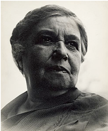
No title [Emma Goldman] 1936 Barcelona gelatin silver photograph more detail