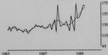
SHORT-TERM RESIDENT DEPARTURES SEASONALLY ADJUSTED AND TREND ESTIMATE (Thousands)

Trend estimate ----- Seasonally adjusted ———