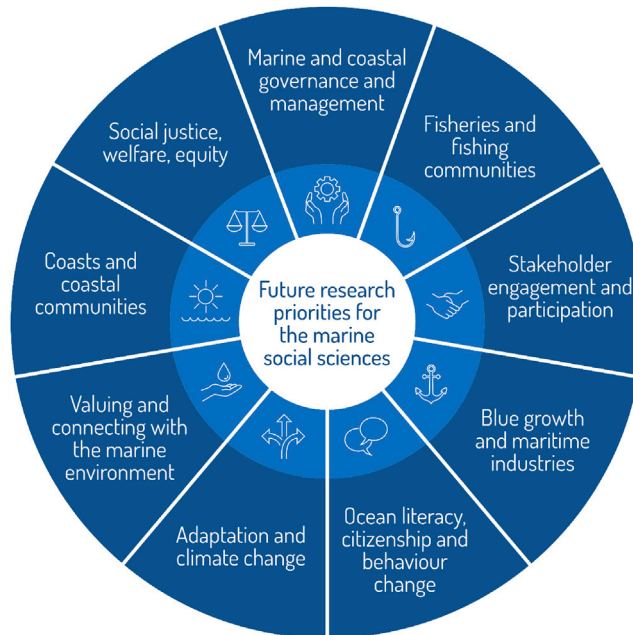
Figure 3. Future research priorities for the marine social sciences

and the ocean, are perhaps a signal of a “turning of the tide” with regards to the role of social sciences within the world of marine science and research. Crucially, however, this study highlights the opportunity to go further, and to recognize the value of true interdisciplinarity, building on inherent interconnectivity and overlaps between some areas of the marine social sciences, and arts and humanities-related disciplines (seen, for example, through the UK’s Valuing Nature Programme). Realizing this, demands systemic change (i.e. in terms of funding calls, design, and development of pathways to impact within decision-making) and a shift in how inter-, and indeed, transdisciplinary research is valued and championed (Cvitanovic et al., 2021a; Blythe and Cvitanovic, 2020; Kelly et al., 2019). These themes, and more, are discussed further in the next section.