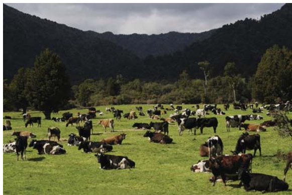
Fig. 2. Intensive dairy farming in New Zealand.