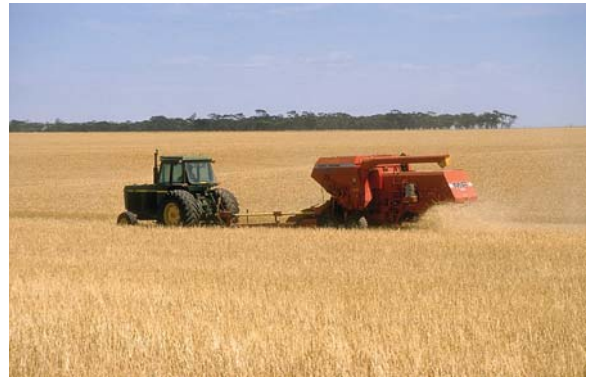
Fig. 3. Temperate eucalypt woodland replaced by grain cropping in Australia.