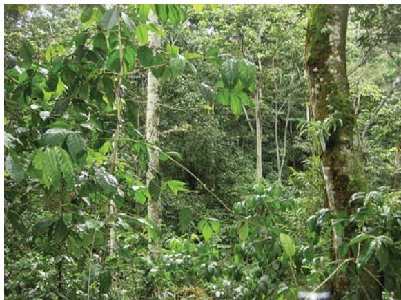
Fig. 4. A structurally complex coffee agroforestry farm in Chiapas, Mexico.

Although many agroforestry commodities like coffee and chocolate are not essential food staples, like basic grains or vegetables, they nevertheless represent an important part of the economies of many poor countries, supporting millions of people throughout the tropics. From an ecological perspective, coffee and cacao are special in that both occur as understory plants and grow well under shade trees, creating an “agroforest” that structurally resembles the forests they replaced (Fig. 4: Fig. 1 quadrants A and C). Coffee and cacao agroecosystems are becoming emblems of managed ecosystems that can be planned to contribute to sustainable agriculture in a variety of contexts. First, as a repository for biodiversity, they sometimes house levels of biodiversity that rival nearby native systems (Perfecto et al., 1996). Second, shaded coffee and cacao systems can contribute a high quality matrix element in landscapes where biodiversity is maintained through dispersal dynamics that promote the persistence in remnant patches (Perfecto and Vandermeer, 2008). Third, because the physical structure of agroforests mimics that of native forests, they are thought to provide a buffer to some of the negative impacts expected under global climate change (Vandermeer et al., 2010). Fourth, the biodiversity harboured within these agroecosystems and the adjacent native habitats contribute to ecosystem services such as pollination and pest control (Vandermeer et al., 2010).