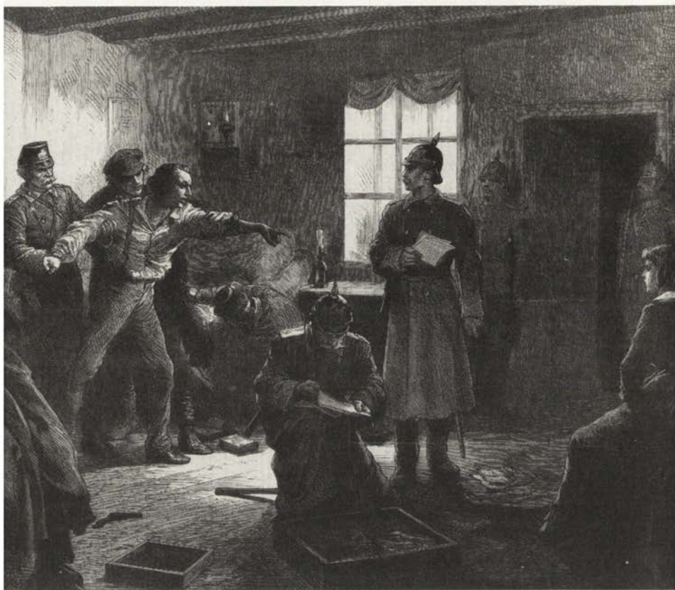
Arrest of a revolutionary student

Flerovsky, Dmitry Pisarev, and many others. The tsar intended these punishments to be a warning to the general public; accordingly, while the trials were held in secret, the so-called "civic executions," staged with a clumsy showmanship worthy of Nicholas I, were held in public. The sentenced men were made to mount a platform erected in one of the big squares in St. Petersburg and to stand, chained to a pole, with placards on their chests saying "State Criminal," while the sentence was read out; in the case of noblemen swords were broken over their heads to signify loss of privi-