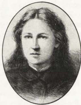
Vera Zasulich