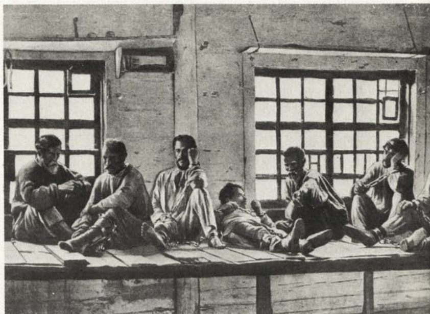
A prison in Kara

cal offenders the convicts formed the smallest group, those tried and sentenced to exile were more numerous, and those exiled without trial, by the administrative method, by far the biggest group. All exiles were at the mercy of the local police and administrators, who could deprive them of the right to work and earn, and subject them to all kinds of petty persecution and punishment. The rules governing the status and supervision of exiles were extremely vague and were generally disregarded. Thus the sore question of whether the state or the exiles paid for the return journey from Siberia—most exiles could not afford it—was never resolved and caused conflicts and mutinies right into the twentieth century. Those exiled to small villages or towns and to the native hamlets in the extreme north suffered most—both from isolation and from physical hardships. In the hamlets of the Yakutsk region of north-