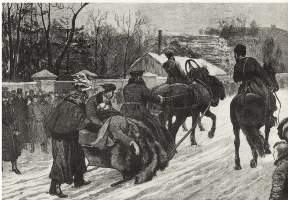
The wounded tsar being driven to the Winter Palace

ers' brigades and military organization which were supposed to start the revolution proved far too weak. A ripple of emotion—fear, expectation, surprise—passed over the country and died away. The peasants were confused, the townspeople mainly indifferent. In the capital, black shrouded in deep mourning, the authorities, the court circles and "loyal" society were confirmed in their ultraconservative, uncompromising attitude.