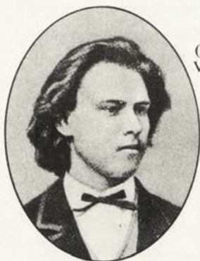
Andrey Zhelyabov ( Byloe , No. 7, 1906, St. Petersburg)