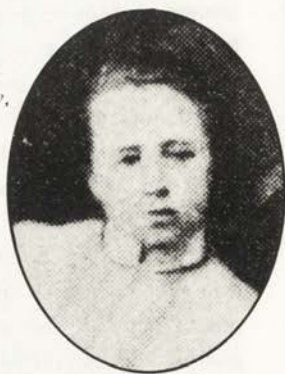
Sofya Perovskaya ( Byloe , No. 8, 1906, St. Petersburg)