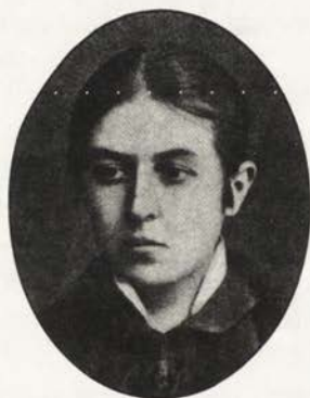
Vera Figner