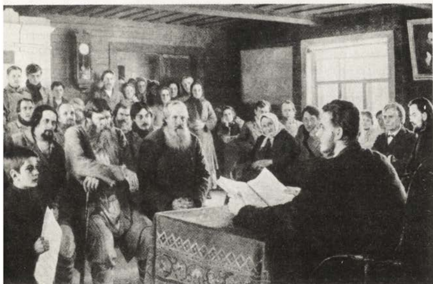
A Sunday Reading (after the painting by Bogdanov Belsky)

In 1858, the idea of opening free schools for poor children or adults, to be run entirely by volunteers, ran like wildfire through Russia. Socialites, landowners, merchants, priests, army officers, university professors and students, ordinary men and women flocked to help, with money or with offers to teach at these schools—at evening or morning classes, on weekdays or on Sundays. Sunday being the generally preferred day, since most of the pupils had to work for their living during the week, Sunday school 24 became the name for all schools of that type, though it had nothing in common with its English equivalent, being entirely secular. The voluntary helpers and teachers brought a tremendous zest to their work. The teaching was humane and enlightened, and