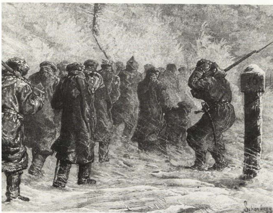
Exiles marching through the snow

gates to sell black rye bread, hard-boiled eggs, cold cooked meat, or pies to the prisoners.