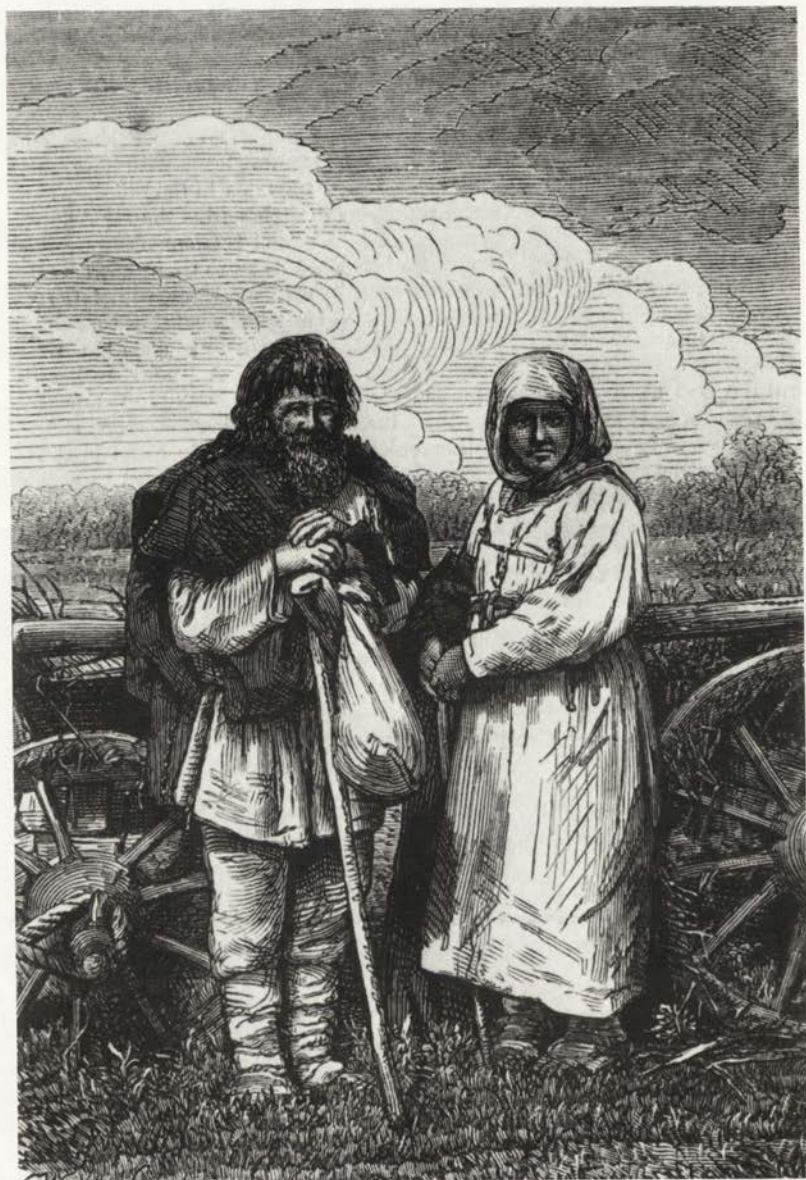
Russian peasants