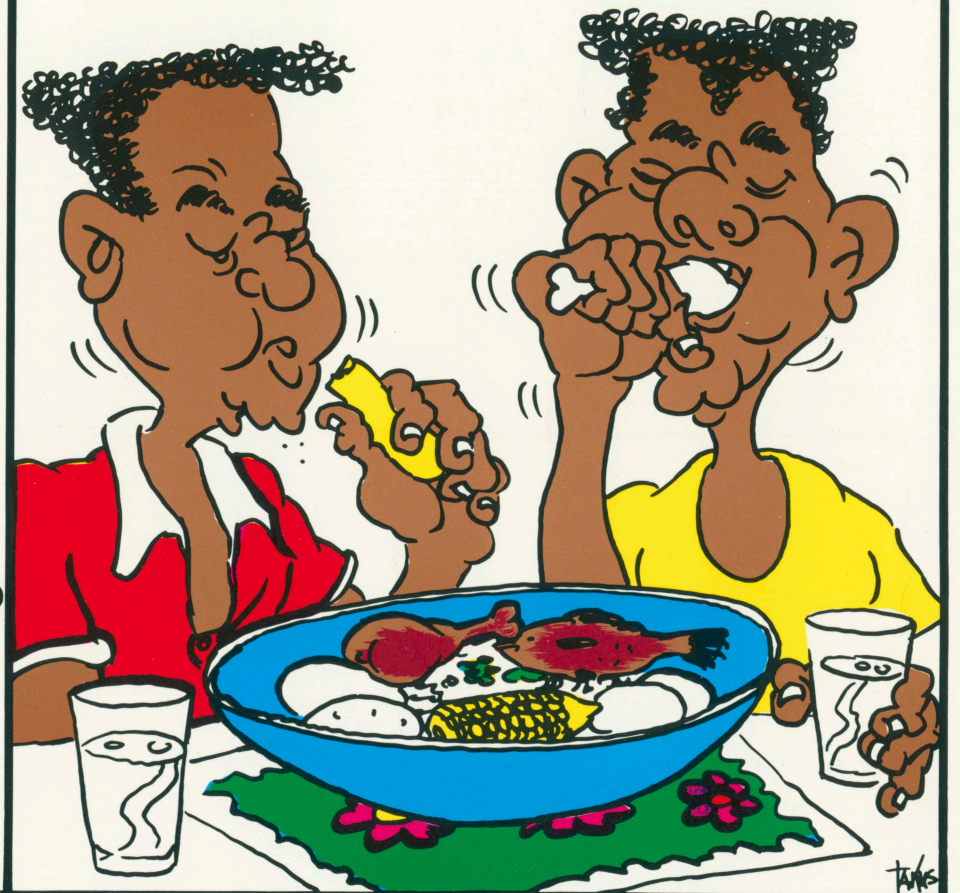
Sharing the same plates - eating out of the same bowls