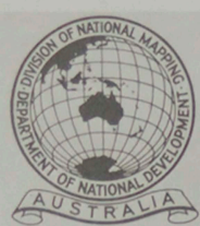
PHOTO INDEX AMAIMON EAST NEW GUINEA

AUSTRALIAN NATIONAL UNIVERSITY DEPARTMENT OF GEOGRAPHY MAP COLLECTION Ref. No. 74a