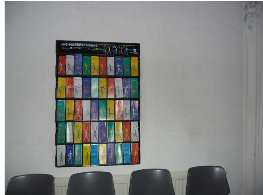
Waiting room in Brielle general practice