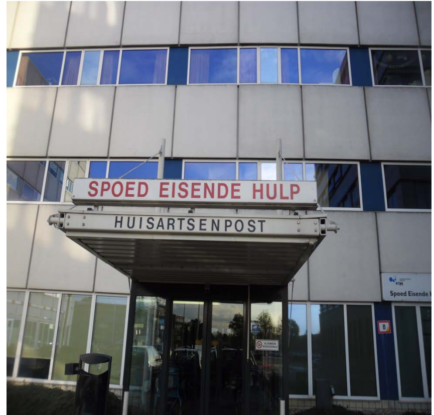
GP post in Maastricht University hospital