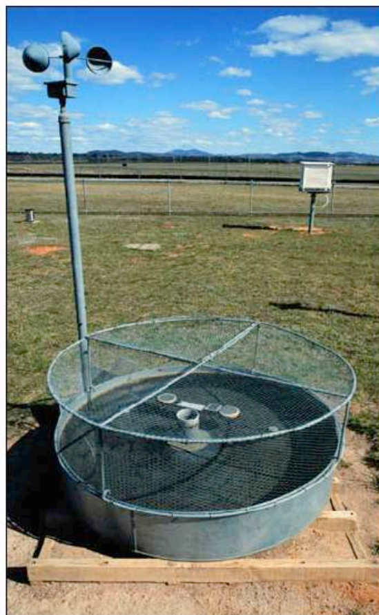
Figure 1. A Class A Pan Evaporimeter run by the Australian Bureau of Meteorology at Canberra Airport.

Why is it so? Is it an artifact of the pan evaporimeter methodology? It was concluded that only one of the known artifacts of pan evaporimeters (as a measure of lake or wet-vegetation evaporation) could cause a decline in readings over several decades. That was the Australian practice of retrofitting bird-guards at various dates for the different pans. However, applying the 7% correction for