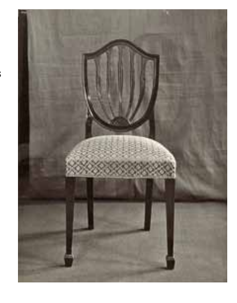
ABOVE Nash-Boothby Studios, Melbourne Chair with Fabric Upholstery, Front View, Government House, Canberra 1927 gelatin silver print 20.3 x 13.9 cm Pictures Collection nla.pic-vn3313737

Collections of things, which range from handmade bird whistles, crockery and pewter to precision-made medical instruments, are also included in the exhibition. When mass-produced objects are involved, such as wool bobbins, aluminium ingots or drums