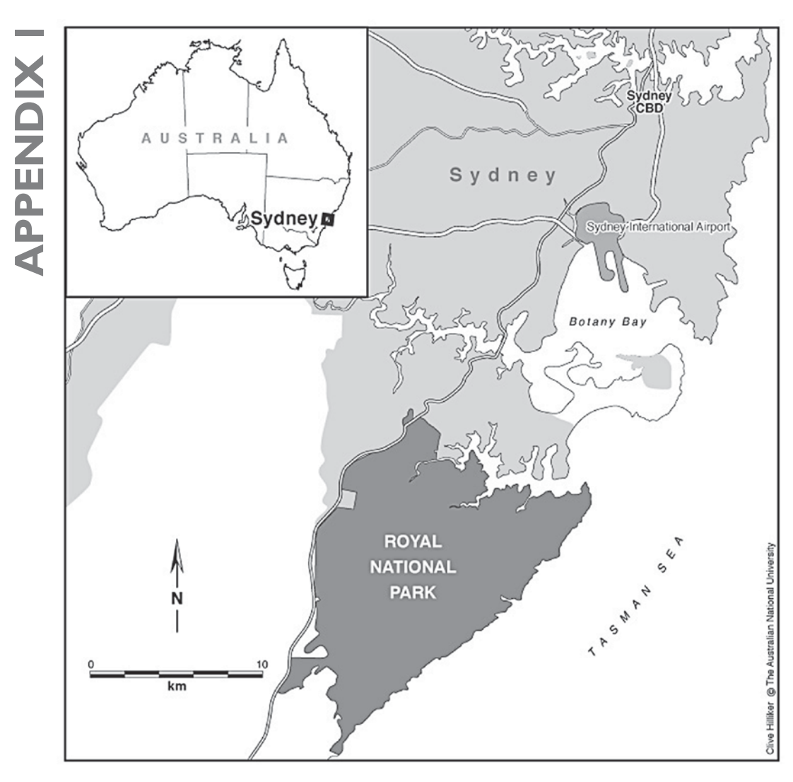
Location of Royal National Park, Australia. (Map: Clive Hilliker).