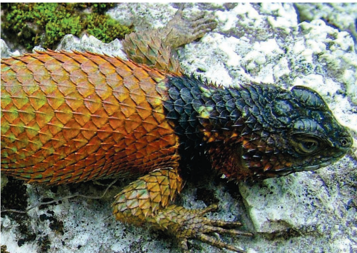
No escape from warming. The lizard Sceloporus serrifer has gone locally extinct at several warmed sites in México.

39% of all lizard populations and 20% of all lizard species will be extinct.