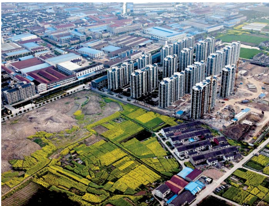
Development in the city of Jiangyin, which lies close to the Yangtze River near China's east coast.