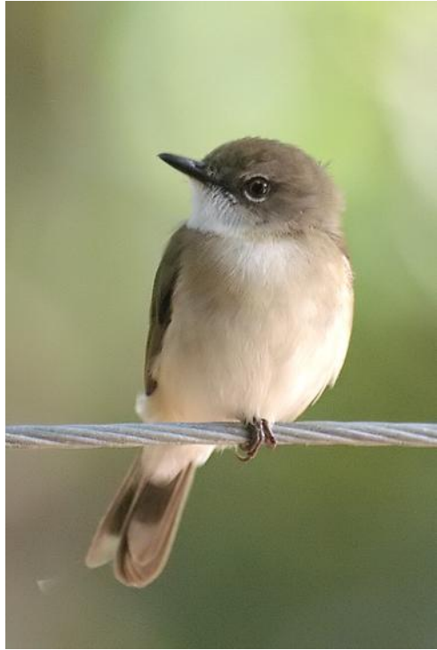
Host and parasite: Large-billed Gerygone (right), and Little Bronze-Cuckoo (below). (Trevor Collins)