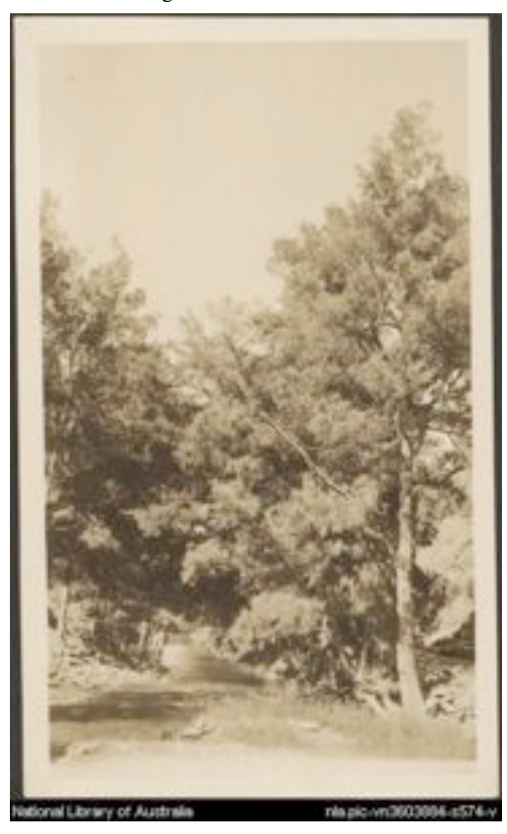
Fig. 2 Casuarina Cunninghamiana growing along a watercourse

The tree Kendall had in mind, given where he spent his early life, was most likely casuarina cunninghamiana , largest of the casuarinas, a handsome species growing in narrow belts along watercourses of the south-eastern coast and ranges.