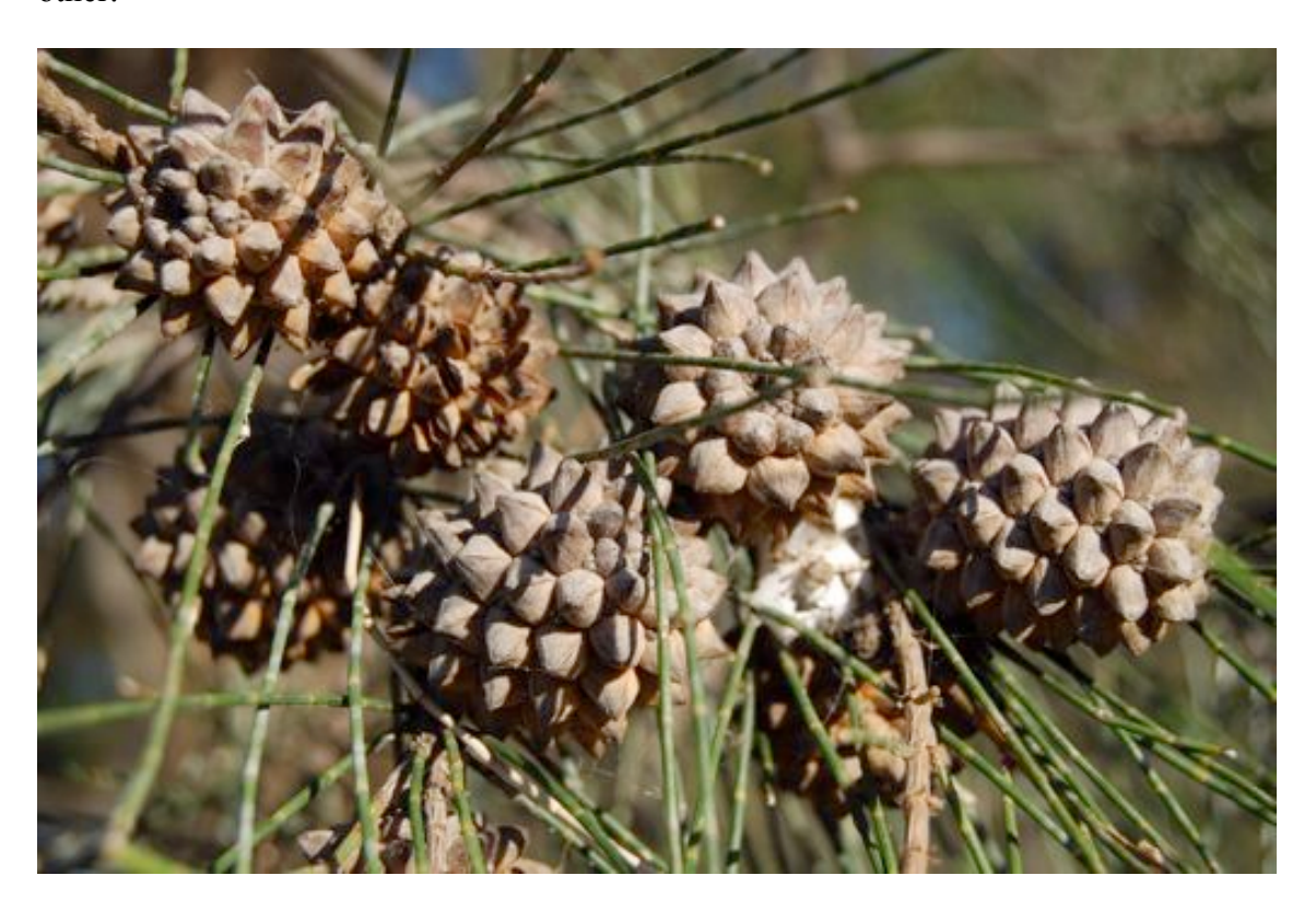
Fig. 1 Detail of Casuarina Cristata showing seed-cones and 'needles' encircled by minute brown leaf-scales

It is easy to guess that the plentiful long and scaly-edged needles act as a wind-instrument once air moves through them. As the trees often grow together in thick groves the effect of wind is intensified and the creaking of branches is added as they rub against each other.