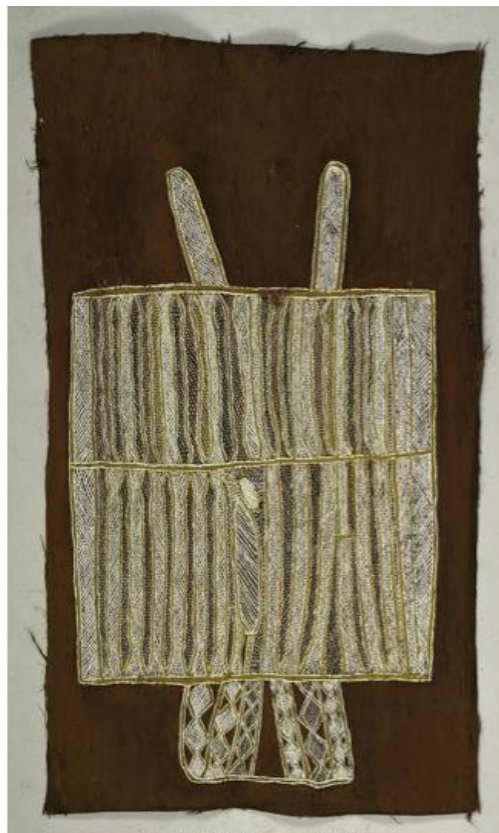
Figure 5 Fish Trap at Baraltja, 1942 . Bark painting by Mundukul Marawili. Collected by Donald Thomson at Caledon Bay on 17/9/1942, while he commanded the Special Reconnaissance Unit of Eastern Arnhem Land ‘warriors’ to monitor Japanese activity. The painting represents the Mouth of the Baraltja River associated with the ancestral snake Burrut’iji or Mundukul. The background design represents the form of an ancestral fish trap made out of the snake’s ribs, and the flow of brackish water through the river mouth during the wet season. The Donald Thomson Collection on loan to Museum Victoria from The University of Melbourne. Copyright the artist’s family. Reproduced courtesy of Buku-Larrnggay Mulka Art Centre.

The first bark paintings from Eastern Arnhem Land that were made for sale to Europeans fall into one of two categories, paintings based on ancestral designs associated with particular places and secular paintings largely comprised of figurative representations that Yolngu refer to as wakinngu — a term which can be loosely translated as ordinary or mundane or colloquially as ‘hunting story’. The sacred paintings were the kind of paintings that would be painted on a boy’s chest prior to circumcision or on a body prior to burial. This association is reflected in the fact that a number of the early bark paintings collected by the anthropologist Donald Thomson and missionary Wilbur Chaseling conformed to the structure of body paintings, including the extensions of the design down the thigh and the lines drawn over the shoulders (figure 5).