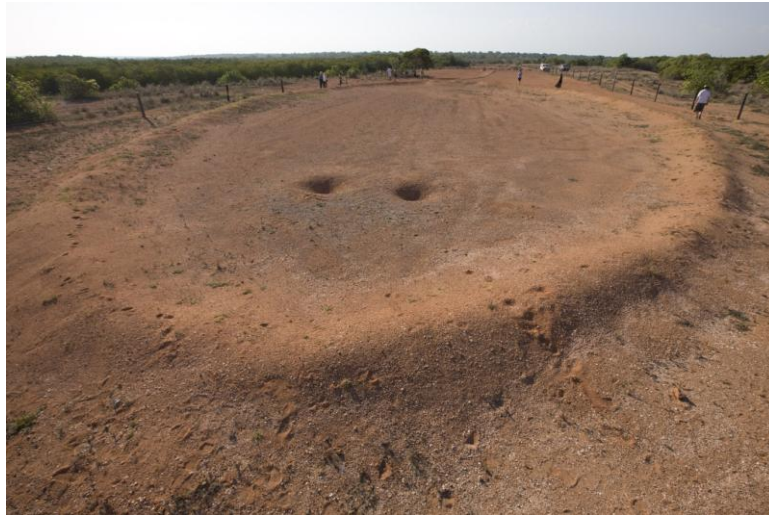
Figure 4 Sand sculpture representing the ancestral stingray, Lulumu, who created an inland path as he fled an ancestral hunter in Wangarr Times. The sand sculpture was recorded by the anthropologist Donald Thomson in the 1930s and is a semi-permanent feature of the landscape near Yilpara on the northern coast of Blue Mud Bay. Fish bones thrown into the two circles that represent the eyes can bring success in hunting.

This history of inclusion indeed is important partly because it is integral to the history of western art practice, but it is not the dimension of history that I wish to dwell on in this paper. My focus here is on the contextual information that is required to understand the artworks that are included in collections and exhibited in art museums. The historic background of artworks, including the history of techniques and form and socio-cultural context is vital to understanding works that are in art museums. There should be no absolute separation between the kind of information concerning provenance, date and sequential position required by art connoisseurs and the evidence required for more broadly conceived art histories. Such information is going to be of differential relevance to different viewers. Some audiences will have a primary concern with the impact of the form of art alone whereas others may view artworks wherever they are displayed as historical documents, and art museums have to cater for those differences. But, in building collections and developing exhibitions, contextual information about the objects is a vital ingredient.