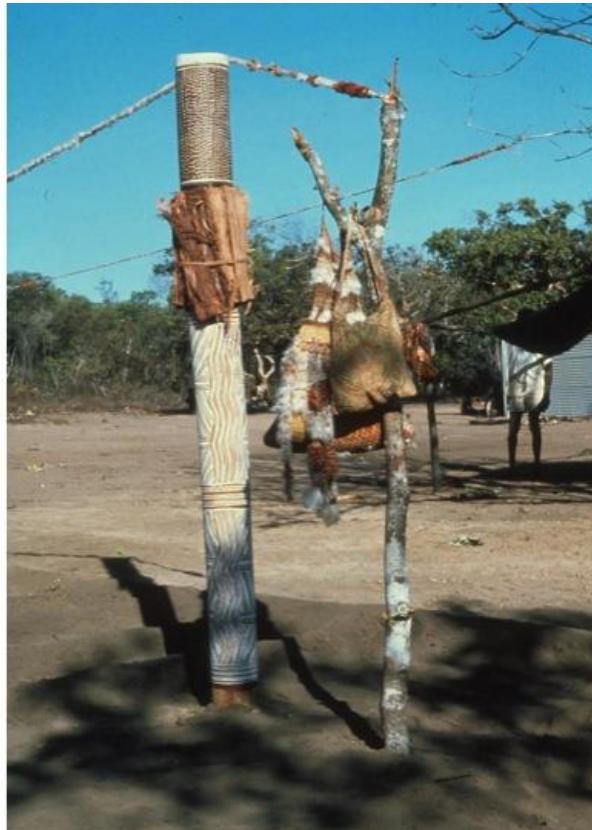
Figure 3 A Djuwany post made for a Djungguwan ceremony held at Gurka'wuy in 1976. The ceremony re-enacts the journey of the Wawilag sisters, two ancestral women, across north east Arnhem Land. The feather string suspended from the post represents their journey and the bags ones that they carried. The ceremony is the subject of Ian Dunlop's 1990 film Djungguwan at Gurka'wuy , Film Australia.

western art practice that enabled ground sculptures, body paintings and minimalist sculptures to have a possible place in the exhibitionary space of the fine art museum. While such analogues often misrepresent Aboriginal art, they unquestionably have influenced its reception. Because Aboriginal art had its own history separate from western fine art it could not easily be fitted into that art history except as an analogue for possible early stages of its development — for example as primitive art. In many respects the arts of Africa, Oceania and the Americas occupied that space much earlier, partly because of the influence they began to have on western artists. 9