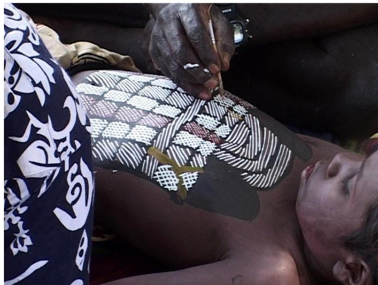
Figure 2 Body painting at a circumcision ceremony at Yilpara in 2001.