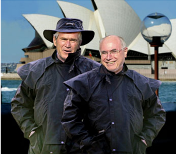
Australian Prime Minister John Howard with President George W. Bush. (The Courier Mail, 31 January 2009)