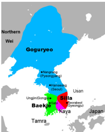
China and Korean peninsula in 6 th century

In meta-historical terms, Japan has preserved a wary distance from China for well over a millennium, ever since the "Battle of Baekgang" (or Hakusukinoe) in the year 663, when the combined forces of Tang-Silla (states then dominating China and the Korean peninsula) defeated the combined forces of Baekje and Yamato (rival states on the Korean peninsula and the Japanese islands). 3