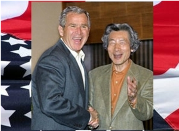
President George W. Bush and Prime Minister Koizumi Junichiro, July 2006

Bureaucratic resistance to servility, as in this "Outline," was inevitably susceptible to compromise because it was elitist and largely detached from popular, grassroots, democratic movement. Bureaucratic groups such as the authors of the "Outline" equivocated in the attempt to push back at the margins against servility, preferring modest adjustments to frontal challenge and rarely if ever confronted the kernel of the relationship. Not until the rise of the Democratic Party 40 years later did that change, when the "zokoku question" merged with the "Okinawa question" (on which below).