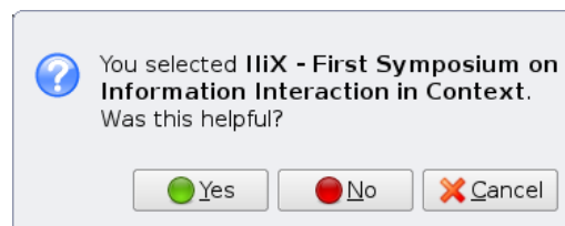
Figure 2: Extra feedback from the two-panel interface

Although participants were not asked what servers were used, and PIS did not record this information, informal feedback indicated that