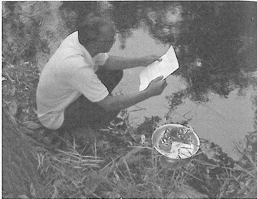
Figure 6.1 Reciting the prayer of invitation to Upakhut.

considerable fame. The procession then made its way back to the village, Upakhut silent on his tray and the spirits dancing around causing mayhem with young children and thrusting what appeared to be prominent erections beneath their robes in the direction of respectable village matrons. "This is just a small ritual", I was assured, "it will be much more fun in the coming days." When the procession reached the temple, the spirits had no hesitation in entering, dancing their lurid way inside the compound, until their skins and heads were eventually shed and hidden away in a back room. Meanwhile, Upakhut was installed in a temporary pavilion at the back of the temple compound, next to the spirit house of the temple's protective spirit. Upakhut was provided with a monk's robe, begging bowl, water bottle, pillow and fan. He was there to protect the festival. Food offerings were bought to him on the mornings that followed.