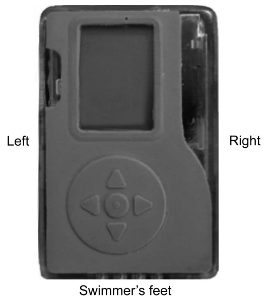
Figure 1. Inertial sensor package (MiniTraqua™) used to quantify kick count and kick rate. The image is presented to scale and is orientated as it appeared on the thigh and shank during testing.

The inertial sensors (MiniTraqua™, version 5, Cooperative Research Centre for Microtechnology, Australian Institute of Sport) are housed in a waterproof plastic casing with external dimensions 5.2 \times 3.3 \times 1.1 cm, mass of 20.7 g, and volume of 18.9 \text{ cm}^3 (Figure 1). The device includes: a \pm 2 g tri-axial accelerometer (Kionix; Model KMXM52, New York, USA); a single > 600 \text{ rad} \cdot \text{s}^{-1} angular-rate sensor (gyroscope); a 256-megabyte memory for data storage; USB interface for charging, calibrating, firmware upgrade, and downloading data; a