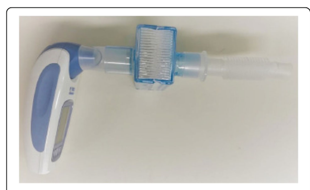
Fig. 2 Attachment of electronic inspiratory muscle training device to filter and connector

Bissett et al. Critical Care (2020) 24:103 Page 5 of 9