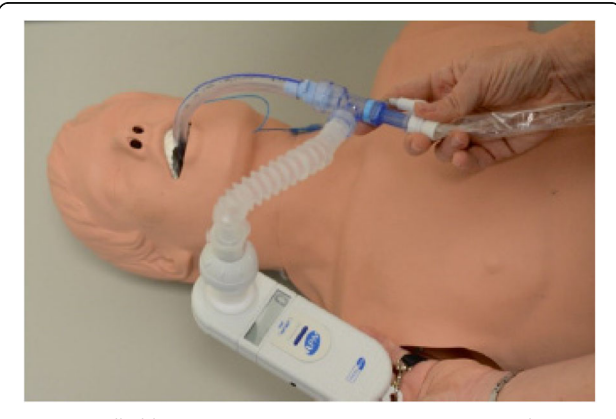
Fig. 1 Handheld respiratory pressure manometer connected to endotracheal tube for measurement of maximal inspiratory pressure (Reproduced from [14] with permission)

For cooperative patients recently weaned from mechanical ventilation, measurement of maximal inspiratory pressure can be feasibly done through either the mouth