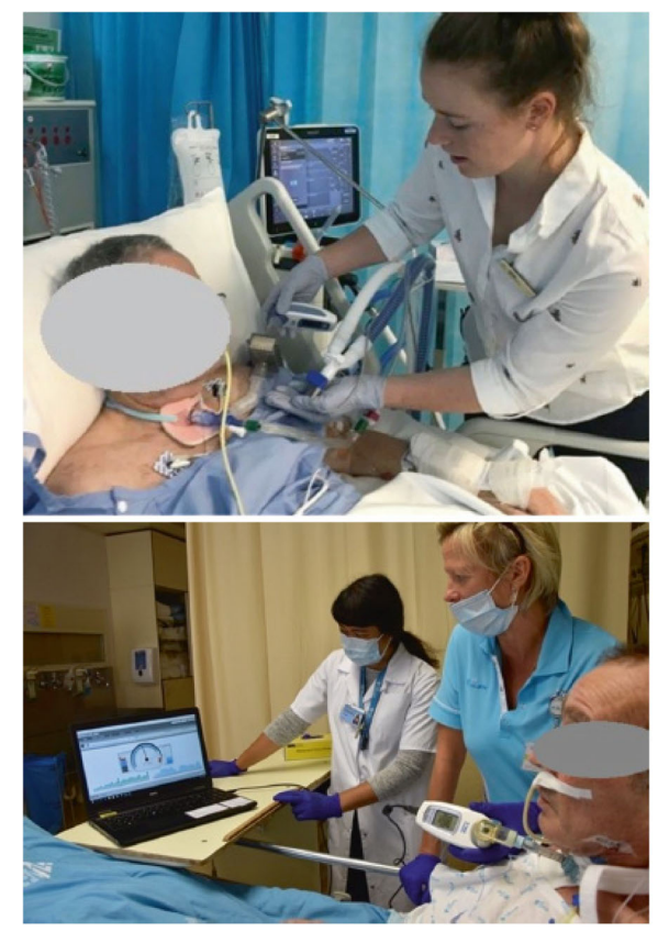
Fig. 4 Tapered flow resistive loading inspiratory muscle training in a ventilator-dependent patient (upper panel). Visual feedback provided during tapered flow resistive loading in a ventilator-dependent patient (lower panel)

Furthermore, this new technology can provide visual feedback of the training on a computer screen (Fig. 4 lower panel). This information allows better guidance of the training by the physiotherapist, while the visual feedback on the screen stimulates the patient to achieve