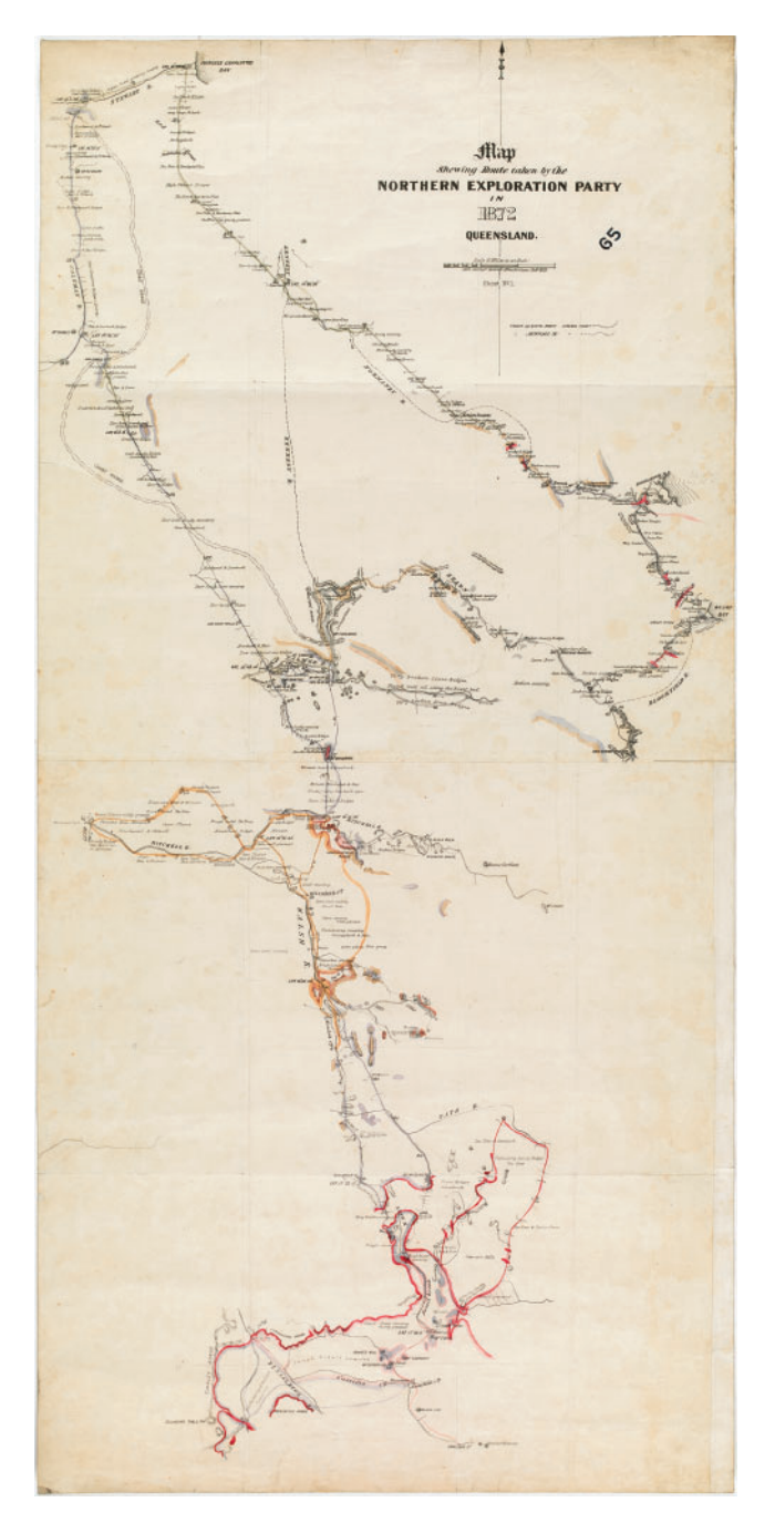
Fig. 5. A copy of the map coloured by Taylor following the expedition after the original accompanying his report had been lost. Reproduced with permission from the State Library of Victoria. <sup>70</sup>

The descriptions, reports and map that were produced represented the most comprehensive information of the region available