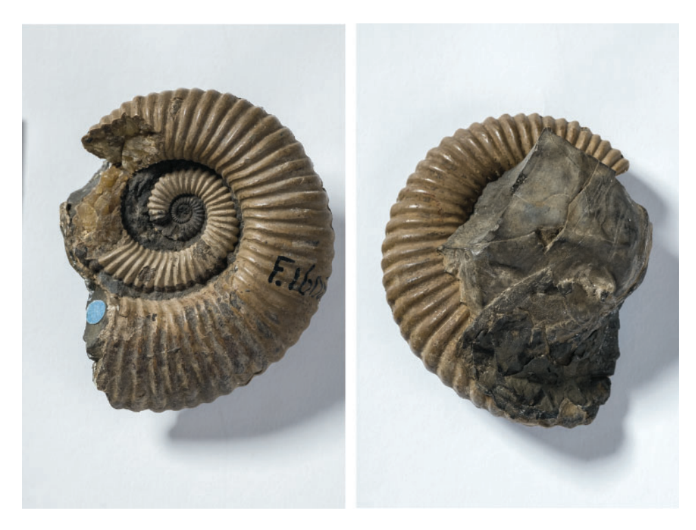
Fig. 6. Example of one of the many fossils collected on the William Hann Expedition, and later named, Tropaeum undatum. <sup>81</sup> Images provided by ©Queensland Museum, Peter Waddington, QM1605.

In summary, the Northern Expedition of 1872 was important in providing pertinent geographical and geological information across a vast area of north Queensland that was otherwise a 'blank canvas' in Western geography before the expedition. More specifically, however, the geological findings were not spectacular other than the gold found in Palmer River. The palaeontological significance was valuable along with the anomaly associated with the fossilised leaves and molluscs found in sandstones. Taylor himself conceded that he: