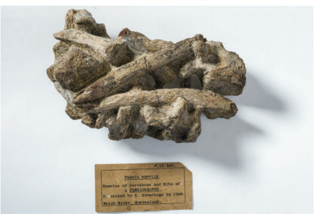
Fig. 7. Vertebrae of a plesiosaurus attached to each other by limestone. Jack and Etheridge (1892)<sup>88</sup> understood them to be Ichthyosaurus vertebrae but is now believed to be a plesiosaur as originally proposed by Taylor.<sup>89</sup> OMF983.