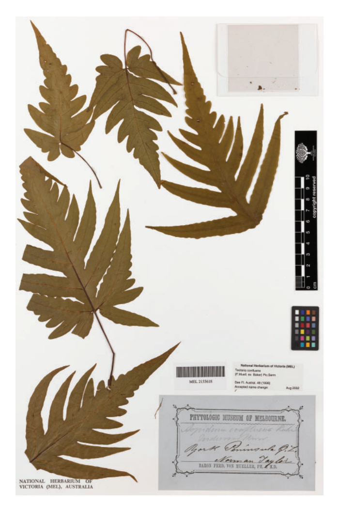
Fig. 9. Typical fern collection by Norman Taylor from the expedition. Tectaria confluens , 'York Peninsula Q.L.'. MEL 2155618.

of the pastoral industry saw significant negative impacts on Indigenous inhabitants. Much of their prime land was trampled by stock, native animal food sources scattered, and watering places taken and or fouled. Allingham describes the sophisticated guerrilla war tactics employed by Indigenous groups against squatters, travellers and shepherds. On As attacks increased so did retribution through the efforts of superior weapons and the notorious native police. Massacres of Indigenous people were also commonplace, especially in the first ten years of settlement of the Peninsula region. Allingham claims that 10–15% of the European population lost