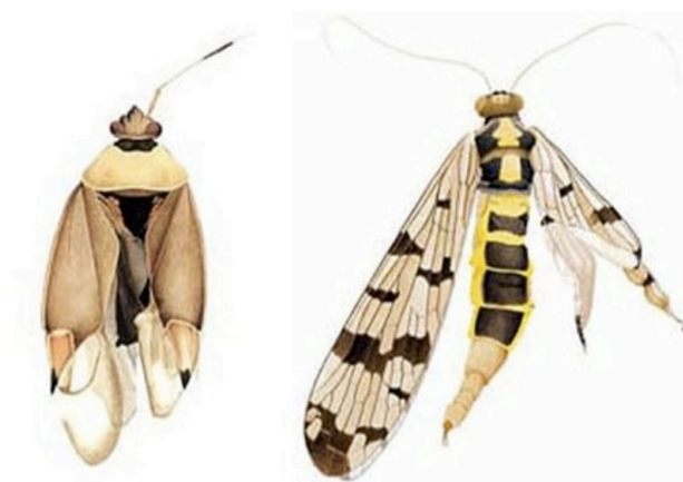
Left: Soft bug (Miridae) from Gösgen, Switzerland ; Right: Scorpion fly (Panorpis Communis) from Reuenthal, Switzerland