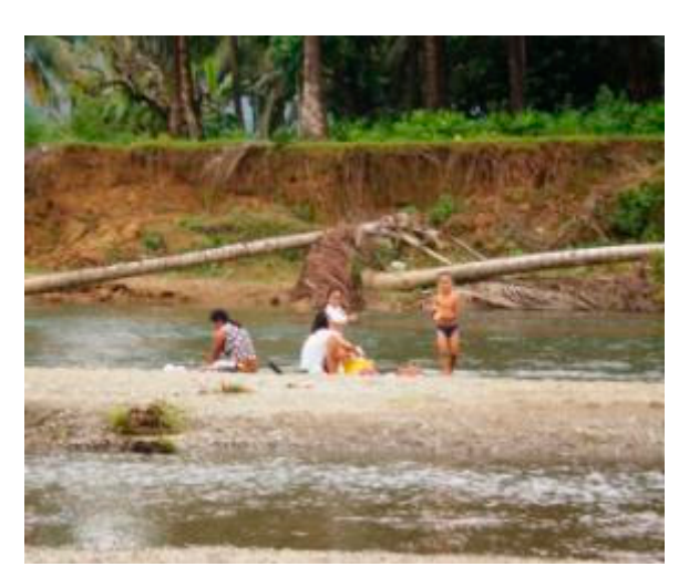
Figure 4. Washing and recreational uses of waterways are risk factors for contracting schistosomiasis. (Image from the Philippines, captured by C.A.G.).

Figure 3. Water buffalo (carabao) in the Philippines are tethered in rivers, rice fields, and wallows—the same areas where the intermediate snail host for S. japonicum is also found. (Images from the Philippines, captured by C.A.G.).