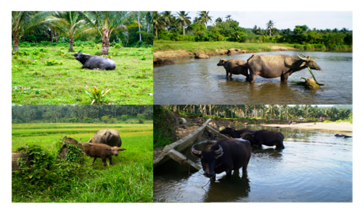
Figure 3. Water buffalo (carabao) in the Philippines are tethered in rivers, rice fields, and wallows—the same areas where the intermediate snail host for S. japonicum is also found.