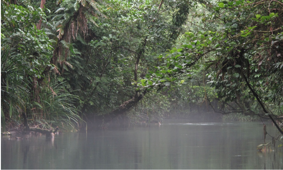
Figure 2 – The “sublime and beautiful” aesthetics of the Malop River mist

destinations for romantic travellers that the 'wild' became less threatening, and the definitions of 'sublime' and 'beautiful' began to converge (Sonntag, 2014: 25).