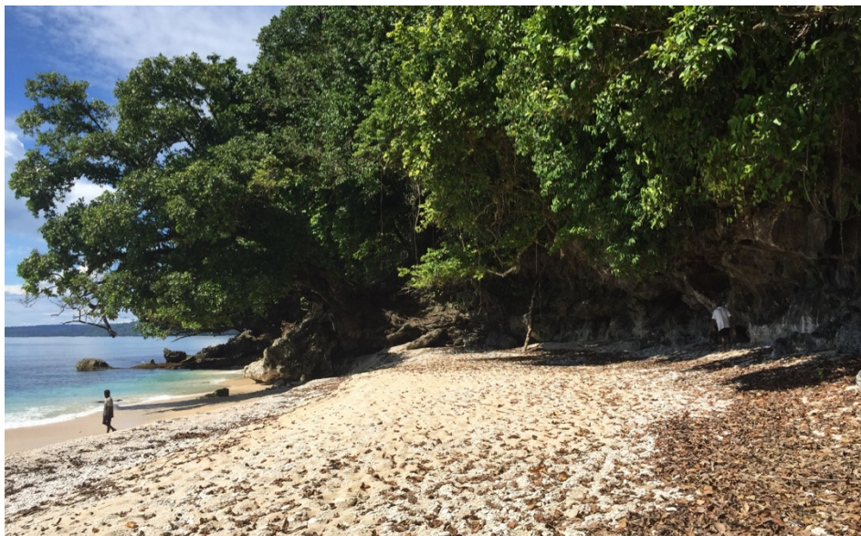
Figure 5 – Coastal beach along Jacquinot Bay (Image, Wood 2016)

Though there were serious questions raised but they stand to say yes. I salute my own clan elders for taking such decisions for the community benefit. There is likely to be 20,000 hectares to kickstart... I was appointed to spearhead the move as it will add more value to Trans New Britain Trail Track. In the meantime Nakanai MTS was [is] on the World Heritage Sites Tentative List but yet nothing is much done by UNDP (GEF) to address the issue. We are now moving forward to get everything running. We are now liaising with senior officers from CEPA to assist whenever we need help. (Linus Bai, Facebook post, 1 February 2016)