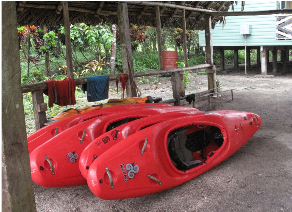
Figure 4 - Kyaks used in the Red Bull Documentary

Just being beside the river changed my whole decision-making process. [It went] from this gorge that I'm just seeing photos of and trying to make a decision on how feasible the whole expedition sounds, to being at a river, which is the environment that I'm very comfortable in. And, at that point, I got way more excited about it, and ready to drop in and just start problem solving. (Altschul, 2015: online)