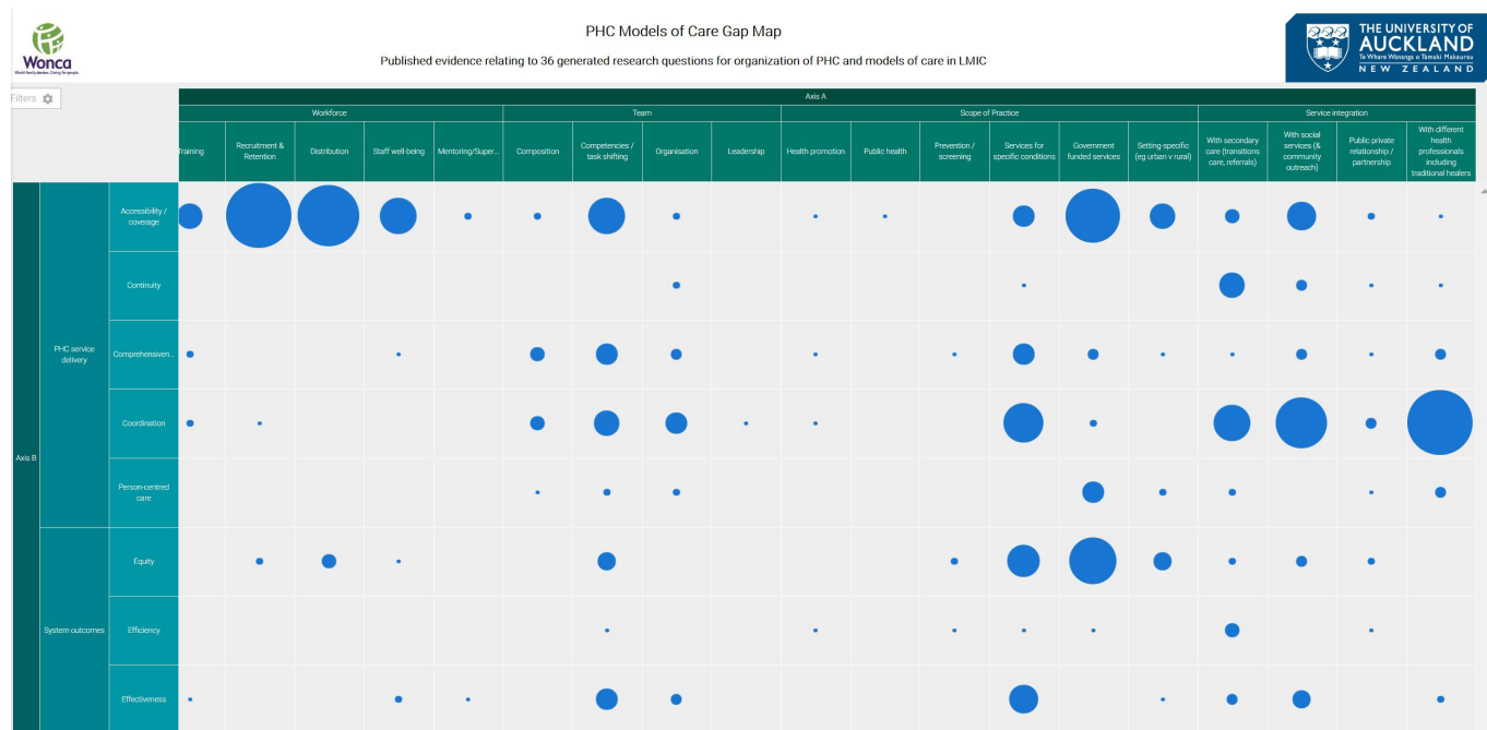
Figure 3 Static version of gap map of studies for model of care.

question were coded for two axes. Seven global regions (Europe, Eastern Mediterranean, Asia Pacific, South Asia, Africa, North America, South America) and a list of all LMICs were included as filters for the map.