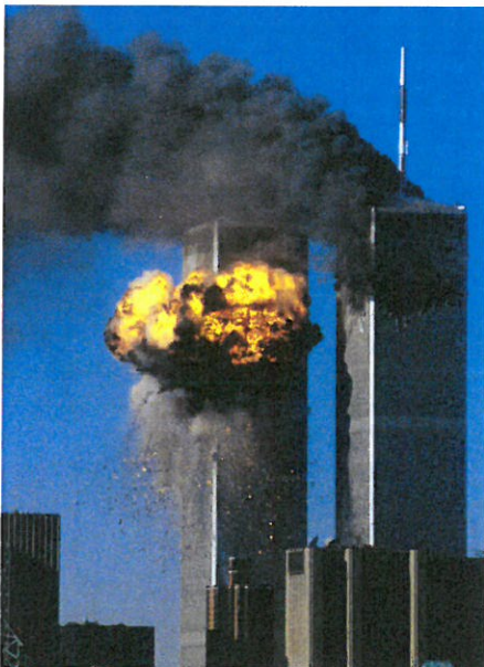
The September 11 attacks were ranked particularly high by men and Coalition and One Nation supporters.

Australians, by and large, share a fairly cohesive sense of the most important historical events that have unfolded in their lifetimes. The events are remarkably similar when examined by characteristics such as gender, place of residence, income, political affiliation, education and birthplace.