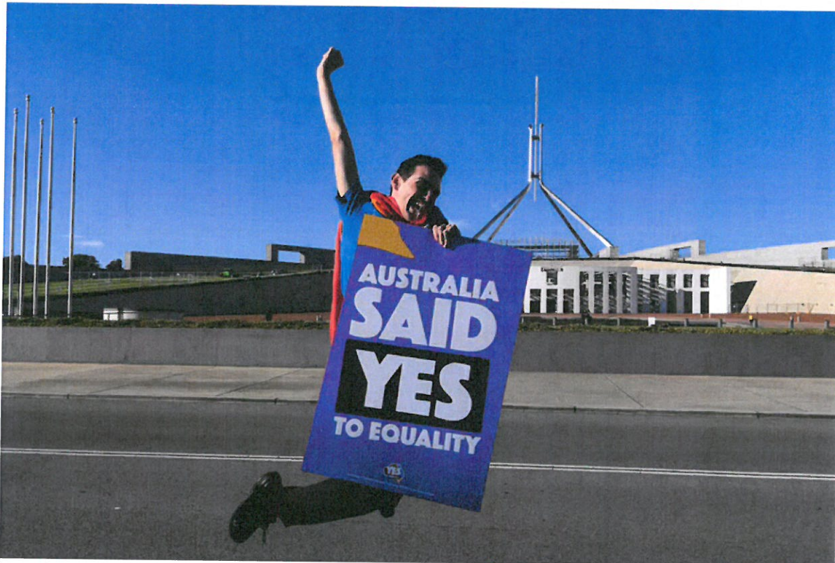
The importance of marriage equality testifies to the endurance of the Australian 'fair go'.