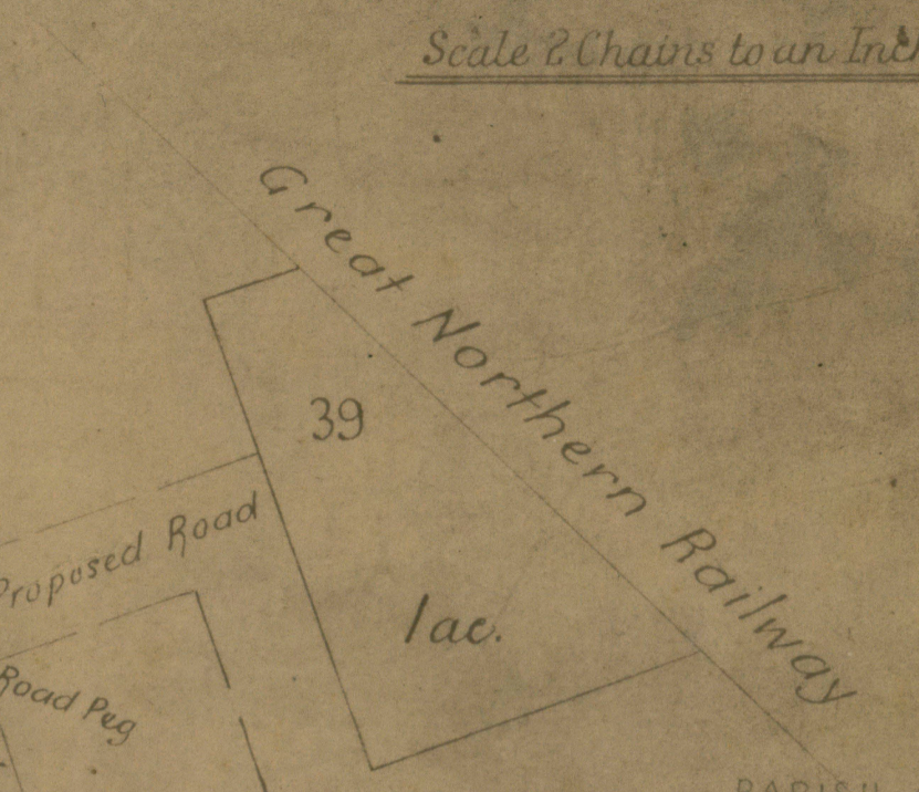
DIAGRAM A. Scale 2 Chains to an Inch