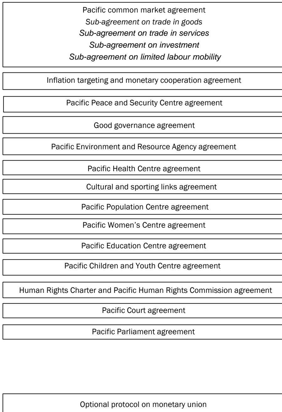
Figure 1 The Pacific single undertaking treaty