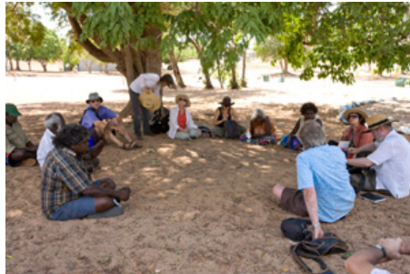
Under the Knowledge Tree with Djambawa Marawili

understandings of the diversity of life. The Yithuwa Madarrpa people have a different perception. Yolngu belief and knowledge is contained within songs, stories, ritual and art. Paintings are conceptual maps depicting living things and earthly elements. All have meaning and are based on complex structures of knowledge and relationships. This is expressed through the Djalkiri, literally meaning foot or footprints, but when applied to Yolngu law it takes on a more profound meaning referring to the underlying 'foundation of the world'. The objective of this project was to bring a group of artists, scientists and print makers together in a cross-cultural, cross-disciplinary, creative exchange. To juxtapose Western scientific view-points and knowledge with the holistic perspective of Yolngu people.