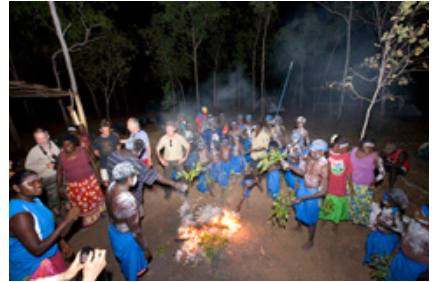
Welcoming ceremony at Banyiala.