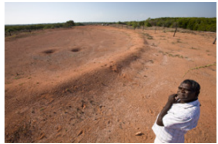
Waka Mununggurr at the site of the sand sculpture of the ancestral stingray Lulumu.