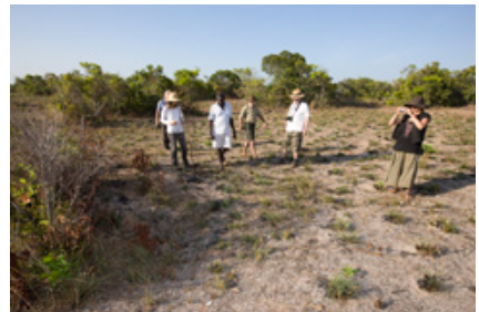
Exploring the Yilpara flood plain with the Laynhapuy Rangers.