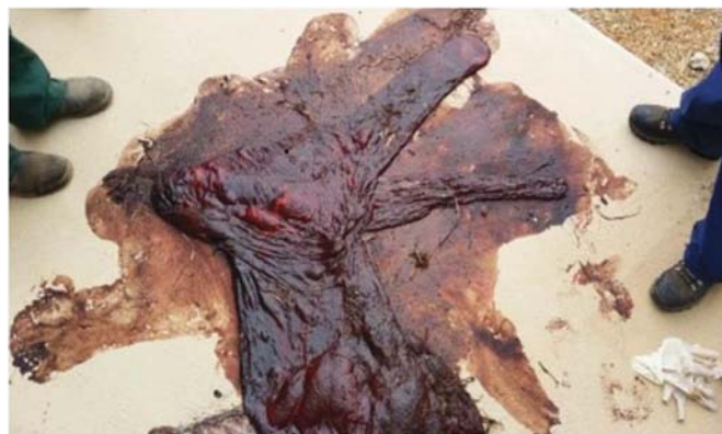
Fig. 1. Infected equine fetal membranes from Mare A, Wagga Wagga, 5 November 2014. (For interpretation of the references to color in this figure legend, the reader is referred to the web version of this article.)

University staff member A was a 25 year old female admitted on 19 November 2015 with fever ( 40.1^{\circ}\text{C} ), headache, back pain, myalgia and