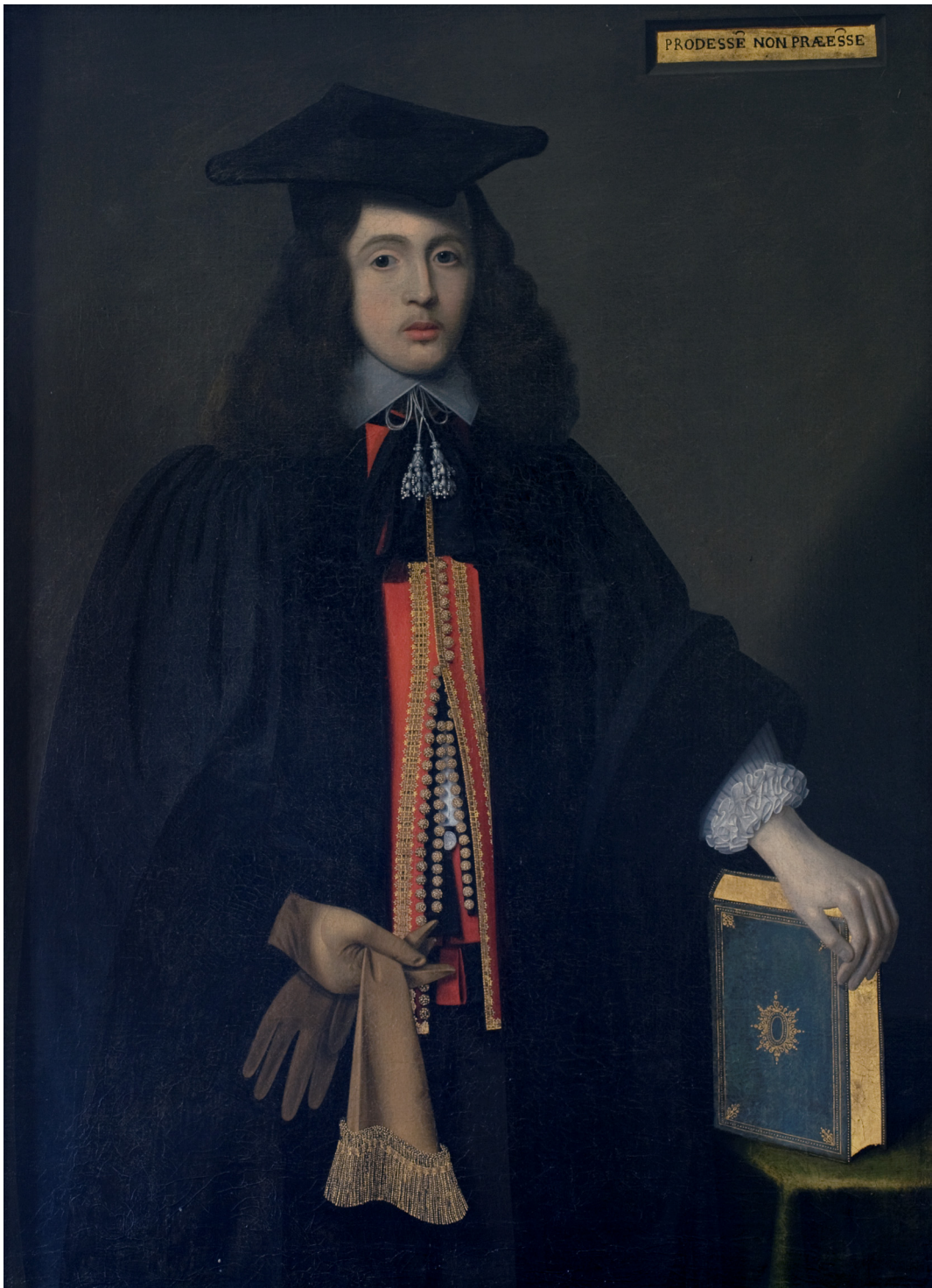
Plate I John de Critz (attrib.), Richard Lovelace [?], c. 1636. Worcester College, University of Oxford (reproduced with permission).