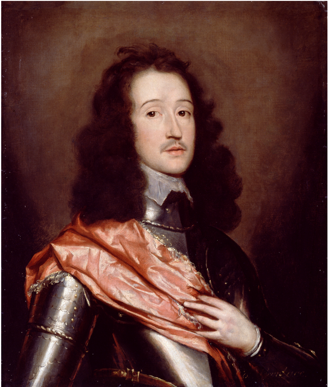
Plate II William Dobson (attrib.), Richard Lovelace , c. 1645. Dulwich Picture Gallery, London (reproduced with permission).