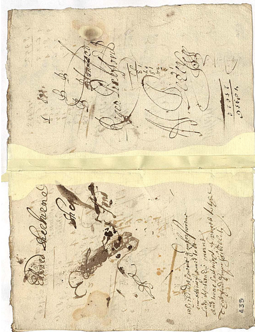
Plate VI Transcription of a verse of Richard Lovelace's poem 'THE SCRUTINIE' and signature by Edward Sherburne from the Royal Ordnance Papers in booklet dated November 1643–February 1644. The National Archives, London, PRO WO55/1661/435 (reproduced with permission).